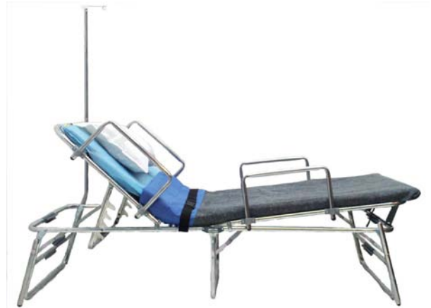
Shown with Optional Safety Rails and Disposable Linens