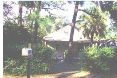
Existing commercial structure on Dearborn St.