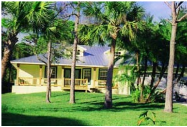
New house in Englewood with old Florida character