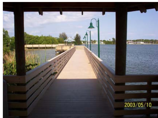
Examples of Lee County Park Boardwalk