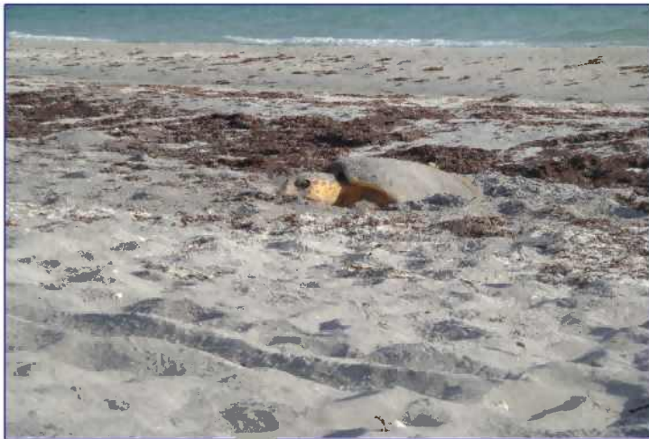
Loggerhead Sea Turtle