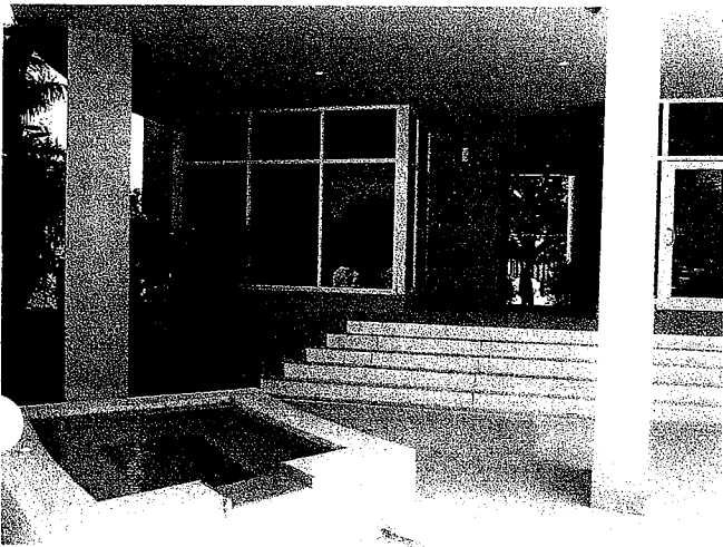
FRONT VIEW 3/24/00