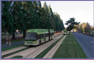
Eugene, OR EMX Busway

During the planning and project development process, FTA evaluates the project's justification and local financial commitment and the sponsor addresses any remaining planning, environmental, engineering, and design issues and requirements. FTA is required by law to approve the initiation of project development and to make funding recommendations after project development is complete.