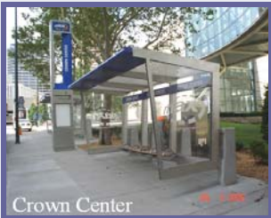
This photo represents a substantial and branded transit station with an integrated passenger information system