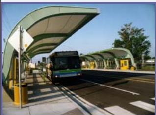
Miami-Dade Busway Station

As with all Section 5309 Capital Investment Grants, the rating process is separate from the budget decisions. Projects that achieve a "medium" or better rating will be eligible to receive Section 5309 Capital Investment Grant funds, but are not guaranteed to receive any funding in the President's Budget.