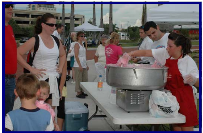
Cotton candy was enjoyed by many at National Night Out.

For more pictures from National Night Out, please see back page.