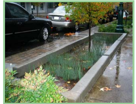
A "green street" in Gresham, Oregon, demonstrates how atmosphere, environment, mobility and community can co-exist.