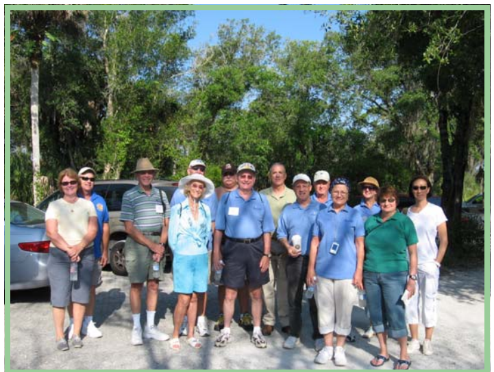
Pictured: A Civics 101 class on an excursion. Field trips and tours of facilities are a part of the Citizens Academy.