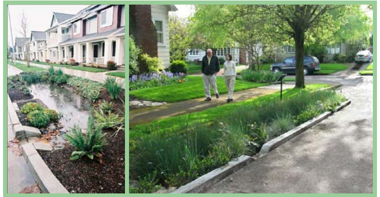
Above: Pictures of various stormwater gardens on sidewalks in Portland, Oregon. This is an example of smart growth development, one of the many topics to be discussed during SustainAbility Month.

Neighborhood Services will be represented on a sustainable growth and development panel titled People, Places, and