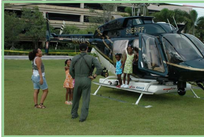
Children could climb inside the Sheriff's helicopter as part of the learning activities associated with National Night Out in Payne Park. For more photos, see back page.

The 25th Annual National Night Out, a joint event by the city of Sarasota, Sarasota County, the Sheriff's office and city police, took place in Payne Park on Aug. 5. Gray skies and the threat of rain did not stop the estimated 1,000 citizens from as far away as Clearwater and Port Charlotte who gathered to enjoy free food, popcorn, children's activities and demonstrations from emergency responders and local police.