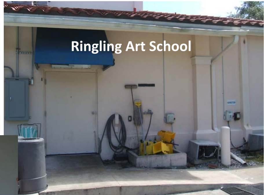
Ringling Art School

BMP: Clean floor mats, equipment, and trash cans in locations that do not drain to the storm drain system. Do not dump mop wash water into a storm drain, ditch, paved area, or onto the ground surface.