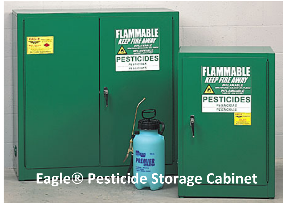
Eagle® Pesticide Storage Cabinet

Photos from Lab Safety Supply for illustration only – NOT AN ENDORSEMENT