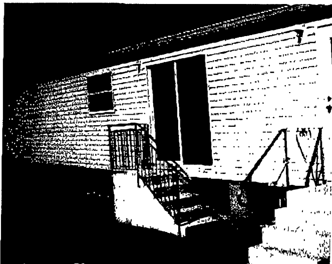
REAR VIEW 12/31/08