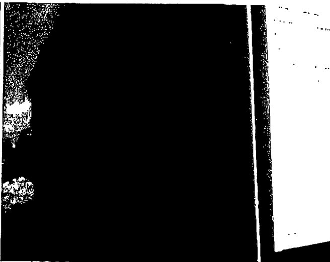
RIGHT VIEW 12/31/08