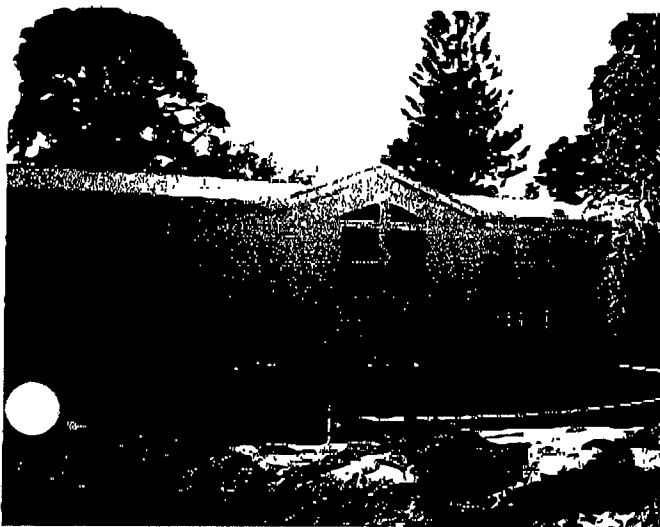
FRONT VIEW 12/31/08

If using the Elevation Certificate to obtain NFIP flood insurance, affix at least two building photographs below according to the instructions for Item A6. Identify all photographs with: date taken; "Front View" and "Rear View"; and, if required, "Right Side View" and "Left Side View." If submitting more photographs than will fit on this page, use the Continuation Page, following.