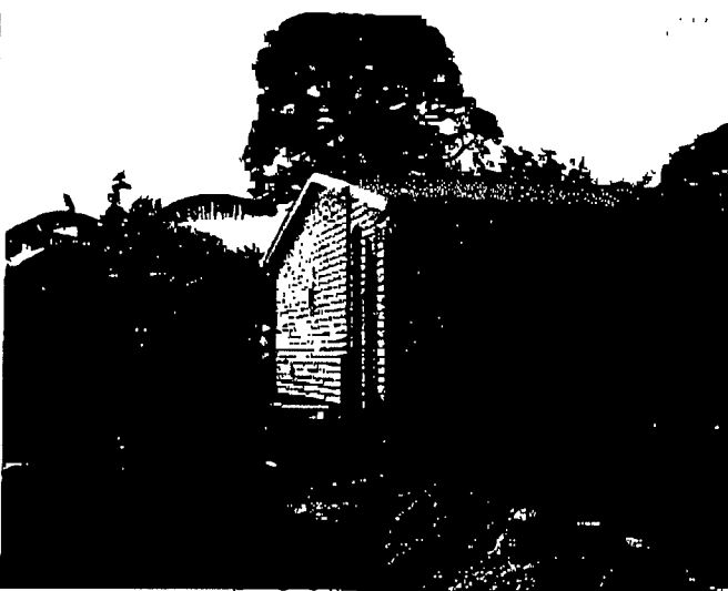
LEFT VIEW 12/31/08