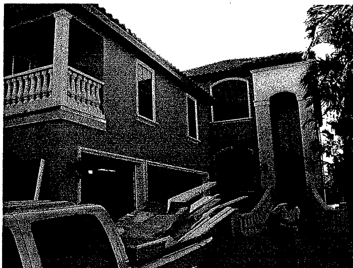
Front View 2-19-2008