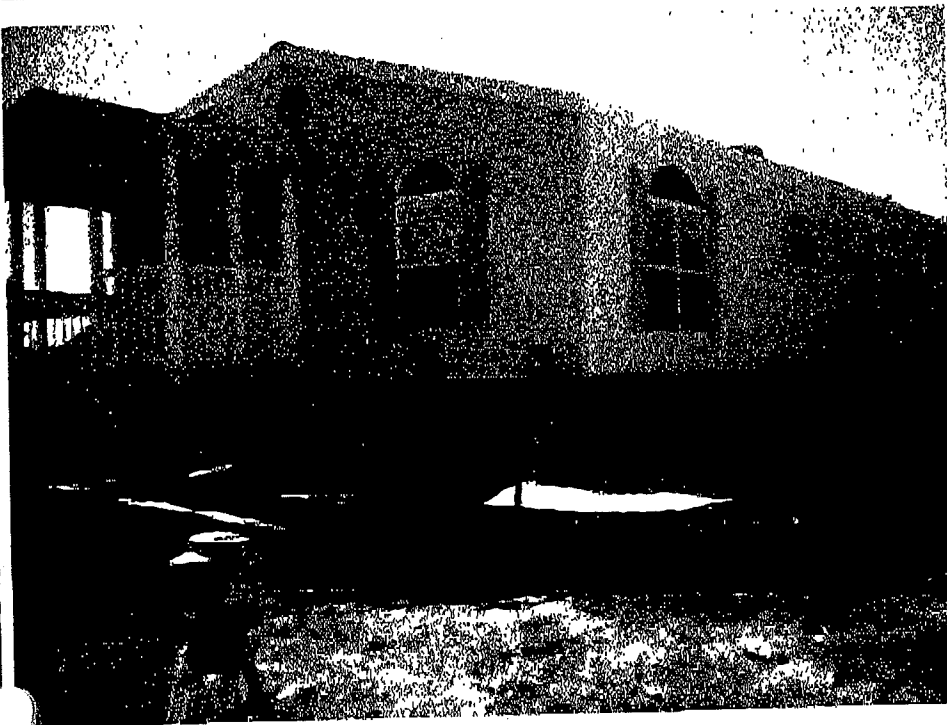
REAR VIEW 04/06/2007