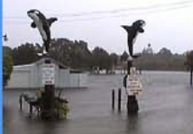
A waterway connecting the Gulf of Mexico back to the bay was severely damaged by a storm surge. A waterway was destroyed and the waterway was closed for several days. The water was so high that it was possible to see the tops of palm trees. The water was so high that it was possible to see the tops of palm trees. The water was so high that it was possible to see the tops of palm trees.