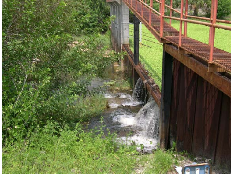
Old Water Control Structure #109 on Cocoplum Waterway with corroded metal weirs and 6 corroded gates. Note water pouring through large holes in the corroded metal weirs.